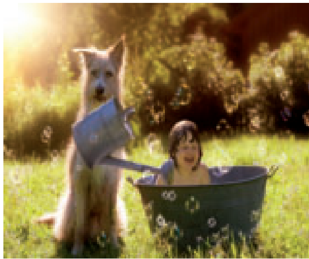
The joy of showering in hot weather shouldn't be taken for granted.

Although compression bandaging is proven to heal venous leg ulcers and reduce the swelling associated with lymphoedema and chronic oedema, it is also known to be uncomfortable and hot for some wearers. Problems such as bandage slippage as swelling reduces can mean the bandaging is ineffective until the next nurse visit to reapply. As limb volume can change throughout the day in some wearers, this can result in the need for daily nurse visits. While bandaging is worn, the wearer is unable to participate in daily routines that many of us take for granted such as bathing or showering and even wearing the shoes and clothes we like. And we won't even mention the itching! It's no wonder